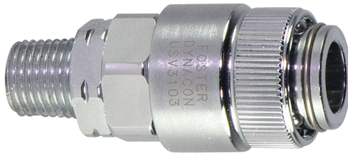
#USV3103 1/4" Socket Shown