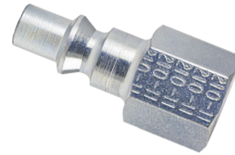
ARO 210 Series (#210-11 1/4")

Works with all 1/4" Body Industrial, TruFlate, and ARO plugs