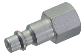
Industrial 3 Series (#11-3 1/4")